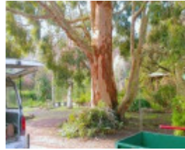
T12193 Angophora costata