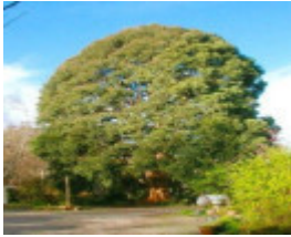
T12193 Angophora costata