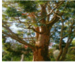
T12193 Angophora costata