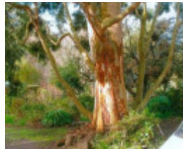
T12193 Angophora costata