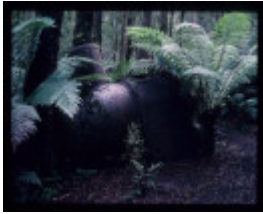
KNOTT'S NO.1 MILL