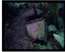
KNOTT'S NO.1 MILL