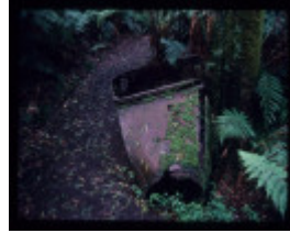
KNOTT'S NO.1 MILL