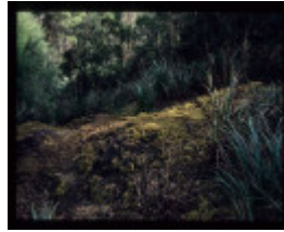
KNOTT'S NO.1 MILL