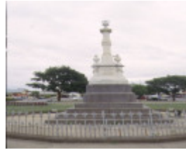
police memorial mansfield front view jan1999