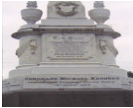
police memorial mansfield inscription detail jan1999