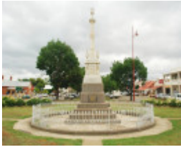
POLICE MEMORIAL SOHE 2008