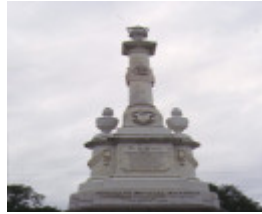
1 police memorial mansfield sculpture detail jan1999