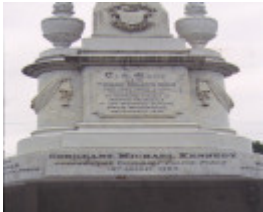
police memorial mansfield inscription detail jan1999