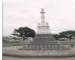
police memorial mansfield front view jan1999