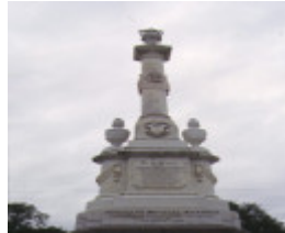
1 police memorial mansfield sculpture detail jan1999