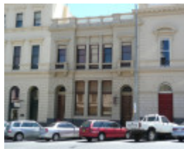
FORMER ANZ BANK SOHE 2008