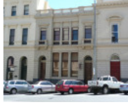
FORMER ANZ BANK SOHE 2008