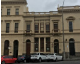
Former ANZ Bank