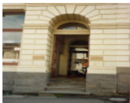
1 former es&A bank lydiard street north ballarat exterior entrance