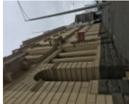
Former ANZ Bank 3