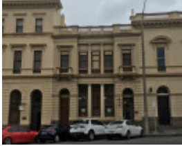
Former ANZ Bank