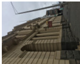
Former ANZ Bank 3