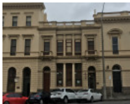
Former ANZ Bank