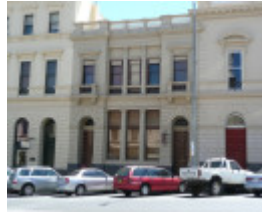
FORMER ANZ BANK SOHE 2008