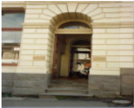
1 former es& a bank lydiard street north ballarat exterior entrance