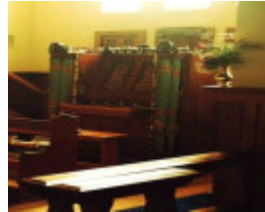
B6219 St John's Pipe Organ