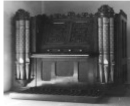
B6219 St John's Pipe Organ