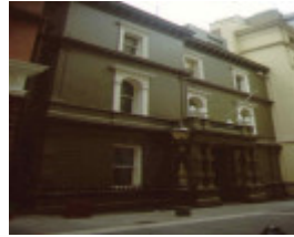
1 savage club exterior sw apr1999