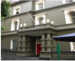
MELBOURNE SAVAGE CLUB SOHE 2008