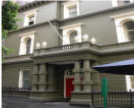
MELBOURNE SAVAGE CLUB SOHE 2008