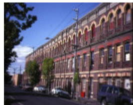
1 former denton hat mills nicholson street abbotsford front view