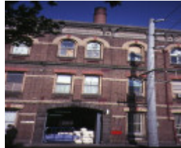
former denton hat mills nicholson street abbotsford delivery entrance