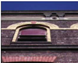
former denton hat mills nicholson street abbotsford detail of window