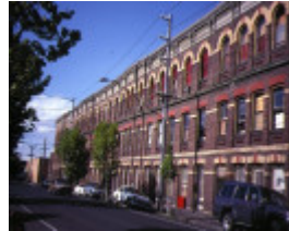
1 former denton hat mills nicholson street abbotsford front view