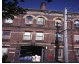
former denton hat mills nicholson street abbotsford delivery entrance