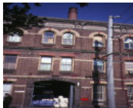
former denton hat mills nicholson street abbotsford delivery entrance