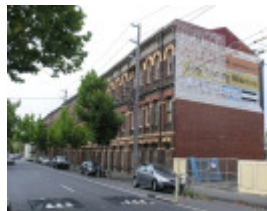
FORMER DENTON HAT MILLS SOHE 2008