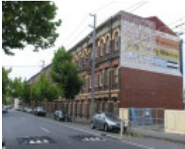
FORMER DENTON HAT MILLS SOHE 2008