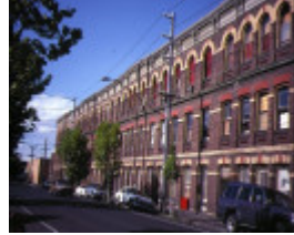
1 former denton hat mills nicholson street abbotsford front view