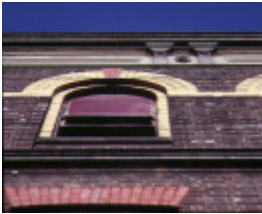
former denton hat mills nicholson street abbotsford detail of window