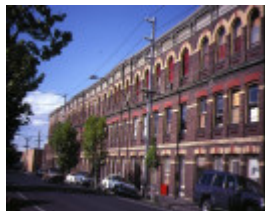
1 former denton hat mills nicholson street abbotsford front view