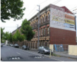
FORMER DENTON HAT MILLS SOHE 2008