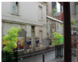
H00435 jobs warehouse bourke street melbourne croseley's building oct01