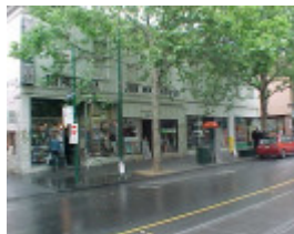
H00435 1 jobs warehouse bourke street melbourne croseley s building oct01