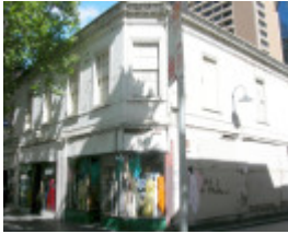
JOB WAREHOUSE SOHE 2008