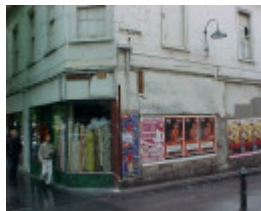
H00435 jobs warehouse bourke street melbourne croseley's building oct01