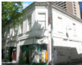
JOBS WAREHOUSE SOHE 2008