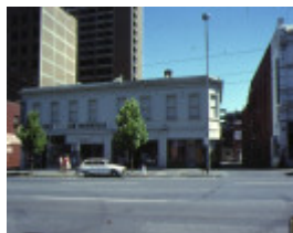
H00435 jobs warehouse bourke street melbourne croseley's building jan1979