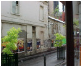
H00435 jobs warehouse bourke street melbourne croseley's building oct01