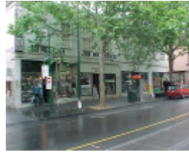
H00435 1 jobs warehouse bourke street melbourne croseley s building oct01