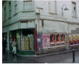
H00435 jobs warehouse bourke street melbourne croseley's building oct01