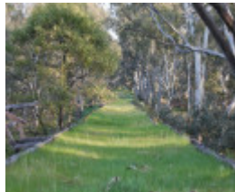
B6921 Fulham deck 2011