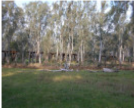
B6921 Fulham Rail Bridge