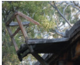
B6921 Fulham safety platform