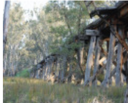
B6921 Fulham Rail Bridge