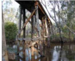
B6921 Fulham Rail bridge