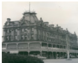
B1853 Shamrock Hotel