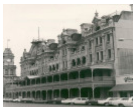
B1853 Shamrock Hotel