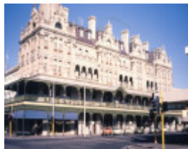
B1853 Shamrock Hotel