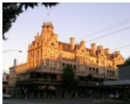
B1853 Shamrock Hotel