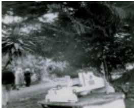
L10088 Churchill Island