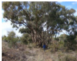
T11161 Eucalyptus melliodora