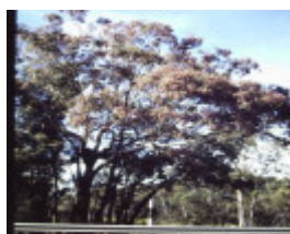
T11161 Eucalyptus melliodora flower