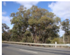
T11161 Eucalyptus melliodora