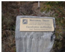
T11161 Eucalyptus melliodora