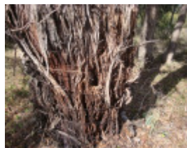
T11161 Eucalyptus melliodora trunk