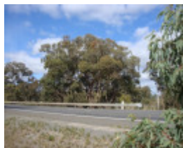
T11161 Eucalyptus melliodora