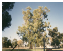
T11176 Eucalyptus cladocalyx