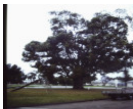
T11176 Eucalyptus cladocalyx