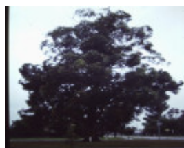
T11176 Eucalyptus cladocalyx