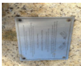
T11176 Eucalyptus cladocalyx plaque