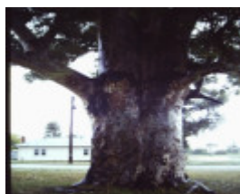
T11176 Eucalyptus cladocalyx