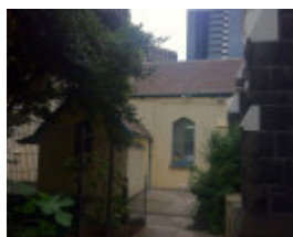
Before Photographs - Reference F3925 2014