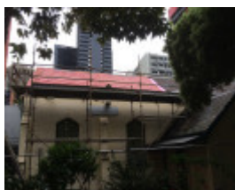
During Photographs - Reference F3925 2015