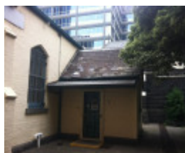
Before Photographs - Reference F3925 2014