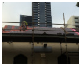
During Photographs - Reference F3925 2015