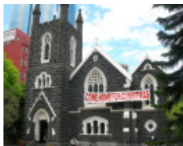
ST AUGUSTINES CATHOLIC CHURCH AND FORMER SCHOOL SOHE 2008