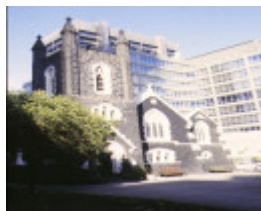
st augustines bourke street melbourne tower elevation 1998