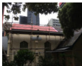
During Photographs - Reference F3925 2015