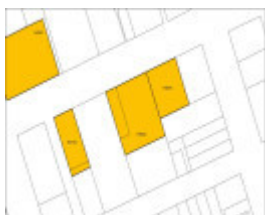
St Augustines Melbourne Registered Land Plan