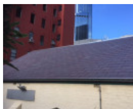
After Photographs - Reference F3925 2016