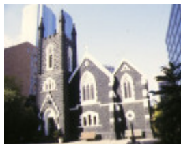
1 st augustines bourke street melbourne front view 1998