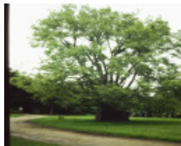
T11243 Ulmus minor 'Variegata'