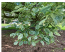
Werribee Park trees - 90