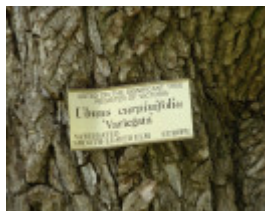
T11243 Ulmus minor 'Variegata'