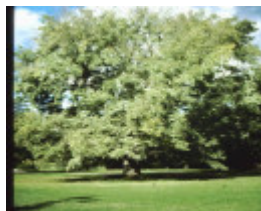
T11243 Ulmus minor 'Variegata'