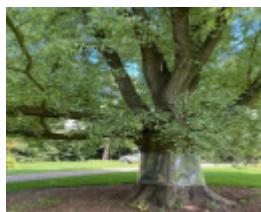
Werribee Park trees - 87