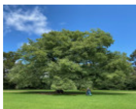
Werribee Park trees - 84