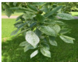
Werribee Park trees - 89