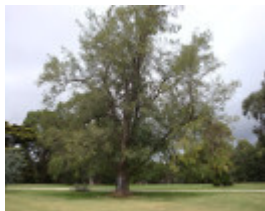
T11243 Ulmus minor 'Variegata'