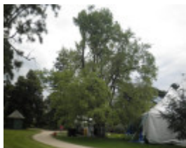
T11243 Ulmus minor 'Variegata'