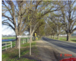
T11281 Ulmus x hollandica