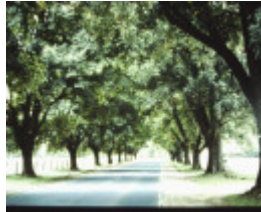
T11281 Ulmus x hollandica