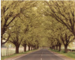
T11281 Avenue of Honour