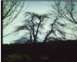
T11290 Pyrus communis