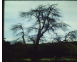
T11290 Pyrus communis