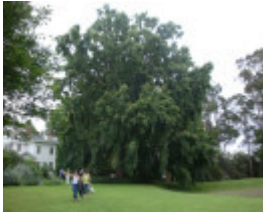
T11508 Quercus Mt Macedon