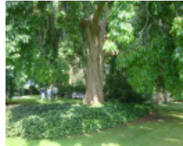
T11508 Quercus Trunk