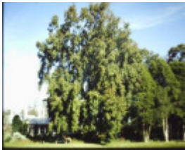
T11508 Quercus Mt Macedon