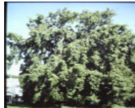
T11508 Quercus Mt Macedon