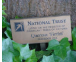
T11508 Quercus Plaque