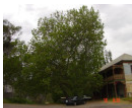
T11684 Platanus x acerifolia