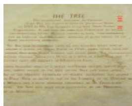
T11684 Platanus x acerifolia