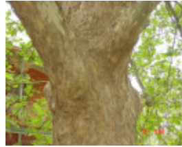
T11684 Platanus x acerifolia