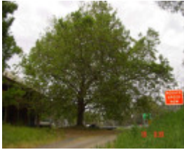
T11684 Platanus x acerifolia