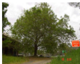
T11684 Platanus x acerifolia