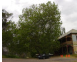
T11684 Platanus x acerifolia