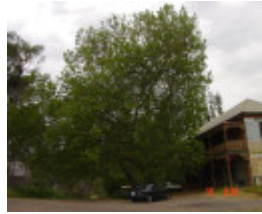
T11684 Platanus x acerifolia