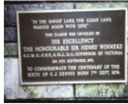
T11733 Fagus sylvatica f. purpurea