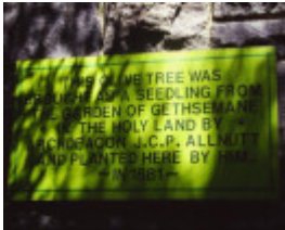
T12018 Sequoia sempervirens