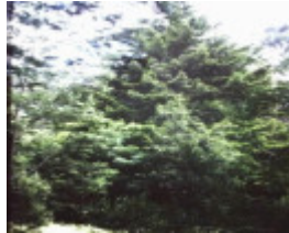
T12018 Sequoia sempervirens