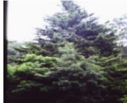
T12018 Sequoia sempervirens