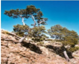
T12041 Callitris glaucophylla