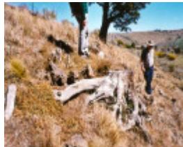
T12041 Callitris glaucophylla stump