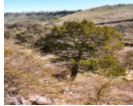
T12041 Callitris glaucophylla