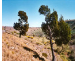
T12041 Callitris glaucophylla