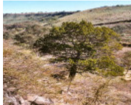
T12041 Callitris glaucophylla