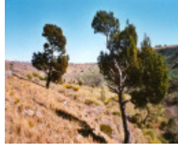
T12041 Callitris glaucophylla