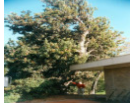
T12055 Banksia serrata