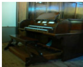
B7359 St Andrew's Pipe Organ