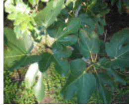
T12097 Ficus carica subspecies carica