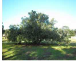
T12097 Ficus carica subspecies carica