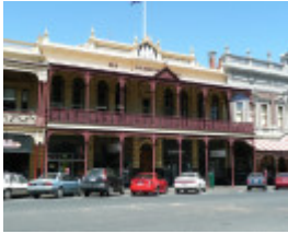
OLD COLONISTS ASSOCIATION SOHE 2008