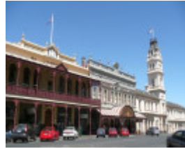
OLD COLONISTS ASSOCIATION SOHE 2008