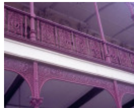
h00116 old colonists hall lydiard street north ballarat iron lace work she project 2004