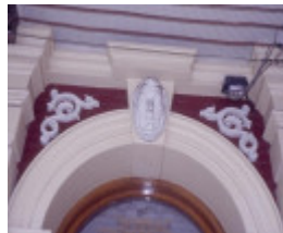
h00116 old colonists hall lydiard street north ballarat death mask over front entrance she project 2004