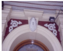
h00116 old colonists hall lydiard street north ballarat death mask over front entrance she project 2004