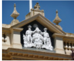
OLD COLONISTS ASSOCIATION SOHE 2008