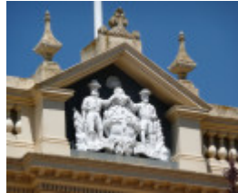
OLD COLONISTS ASSOCIATION SOHE 2008