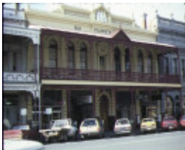
h00116 old colonists club association ballarat front view