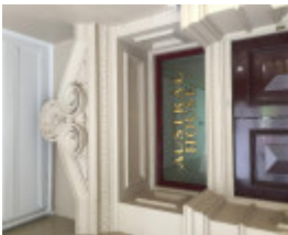
AUSTRAL BUILDINGS Nov 2016