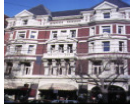
1 austral building collins street melbourne front view