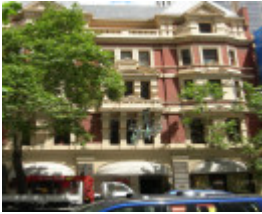
AUSTRAL BUILDINGS SOHE 2008