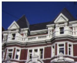
austral building collins street melbourne detail external top floor