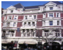
1 austral building collins street melbourne front view