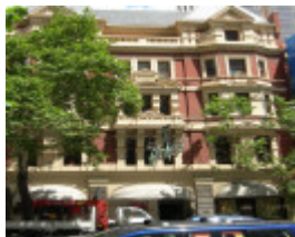
AUSTRAL BUILDINGS SOHE 2008