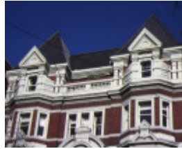
austral building collins street melbourne detail external top floor