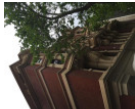
AUSTRAL BUILDINGS Nov 2016