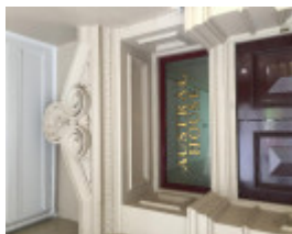
AUSTRAL BUILDINGS Nov 2016