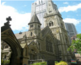
SCOTS CHURCH SOHE 2008