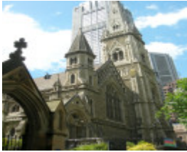
SCOTS CHURCH SOHE 2008