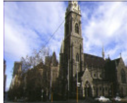
1 scots church melb exterior