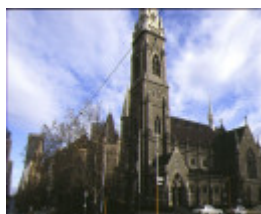
1 scots church melb exterior