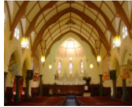
SCOTS CHURCH SOHE 2008