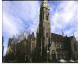
1 scots church melb exterior