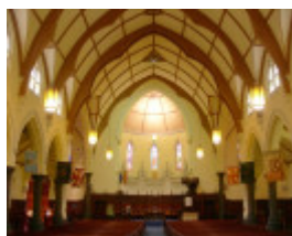
SCOTS CHURCH SOHE 2008