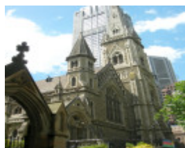
SCOTS CHURCH SOHE 2008