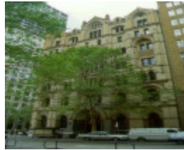
nmla building melb collins street facade sw oct99