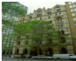
nmla building melb collins street facade sw oct99