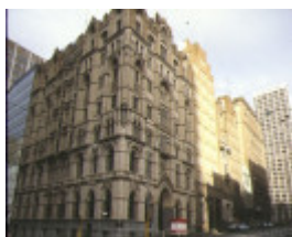
nmla building melb external view