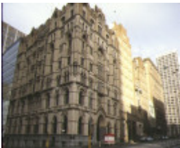
nmla building melb external view