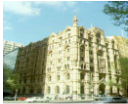
1 nmla building melb corner view sw oct99