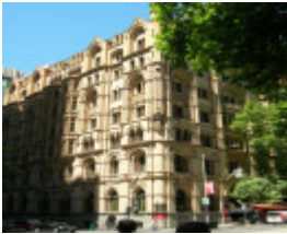
FORMER NATIONAL MUTUAL LIFE ASSOCIATION BUILDING SOHE 2008