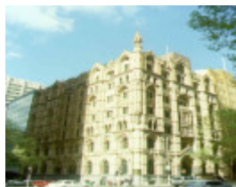
1 nmla building melb corner view sw oct99