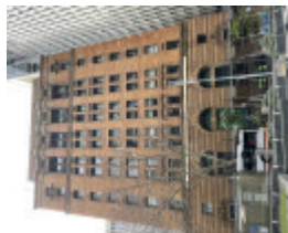
Former AMP Building - western elevation - July 2021