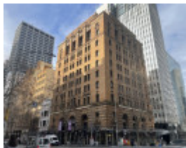
Former AMP Building July 2021