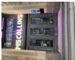
Former commercial entrance