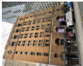
Former AMP Building - northern elevation - July 2021