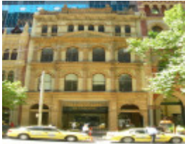
RECORD CHAMBERS SOHE 2008