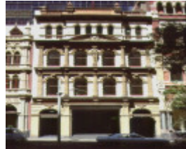
record chambers h38 july2000