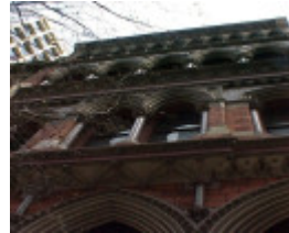
south australian insurance building collins street melbourne front elevation sep1999