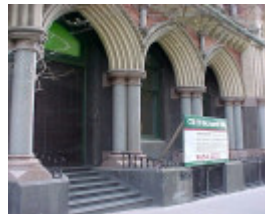
south australian insurance building collins street melbourne street view sep1999