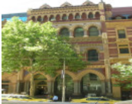
SOUTH AUSTRALIAN INSURANCE BUILDING SOHE 2008