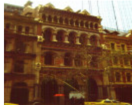
1 south australian insurance building h39