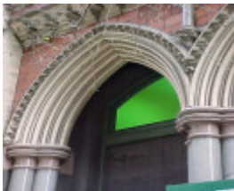
south australian insurance building collins street melbourne facade arch detail sep1999