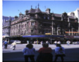
1 melbourne city building elizabeth street melbourne corner view feb1986