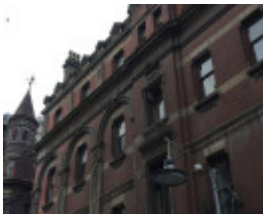
MELBOURNE CITY BUILDING July 2016