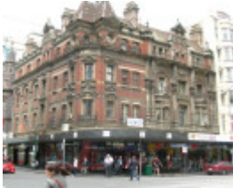
MELBOURNE CITY BUILDING SOHE 2008