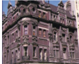
melbourne city building elizabeth street melbourne front detail feb1978