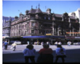
1 melbourne city building elizabeth street melbourne corner view feb1986