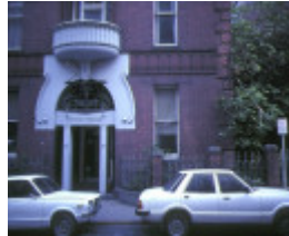
milton house flinders lane melb entrance oct1982