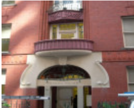
MILTON HOUSE SOHE 2008