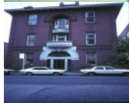
Milton House Flinders Lane Melbourne Front View October 1982