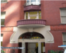
MILTON HOUSE SOHE 2008