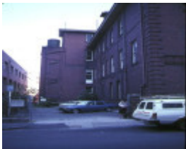
milton house flinders lane melb side view oct1982