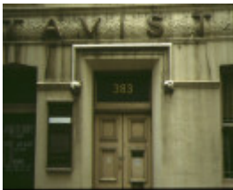
ship inn flinders lane melbourne entrance