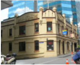
TAVISTOCK HOUSE SOHE 2008