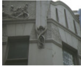
ship inn flinders lane melbourne corner detail