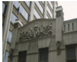
ship inn flinders lane melbourne stone work decoration detail