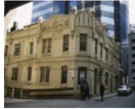
1 ship inn flinders lane melbourne front view