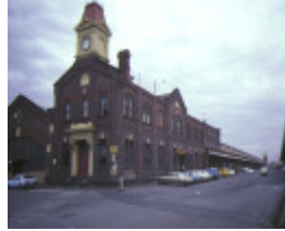
number 3 goods shed & offices flinders street extension melbourne side elevation jan 1985