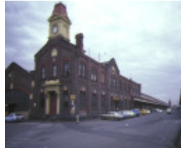
number 3 goods shed & offices flinders street extension melbourne side elevation jan1985