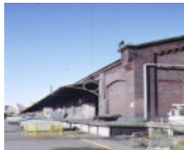
number 3 goods shed & offices flinders street extension melbourne side view