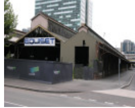
NO.2 GOODS SHED SOHE 2008