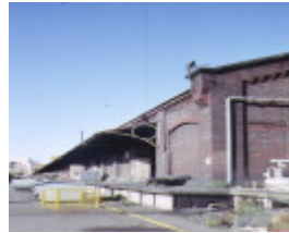
number 3 goods shed & offices flinders street extension melbourne side view