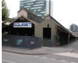
NO.2 GOODS SHED SOHE 2008