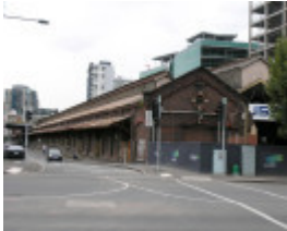
NO.2 GOODS SHED SOHE 2008