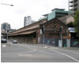
NO.2 GOODS SHED SOHE 2008