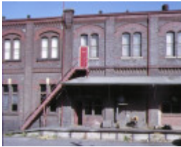
number 3 goods shed & offices flinders street melbourne side elevation