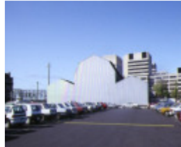
exhibition goods shed spencer street melbourne rear of flinders street extension goods shed