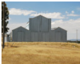
EXHIBITION GOODS SHED SOHE 2008