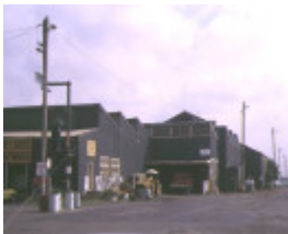
exhibition goods shed spencer street melbourne remnants of number 1 shed