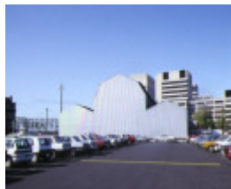
exhibition goods shed spencer street melbourne rear of flinders street extension goods shed