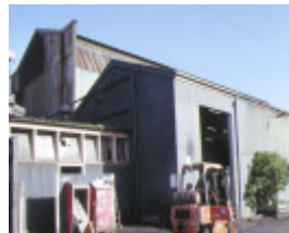
exhibition goods shed spencer street melbourne side view of flinders street extension goods shed