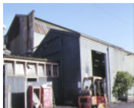
exhibition goods shed spencer street melbourne side view of flinders street extension goods shed