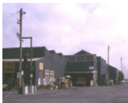
exhibition goods shed spencer street melbourne remnants of number 1 shed