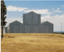
EXHIBITION GOODS SHED SOHE 2008