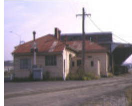
exhibition goods shed spencer street melbourne amenity room number 6 shed mar1989