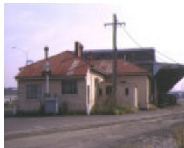
exhibition goods shed spencer street melbourne amenity room number 6 shed mar1989