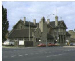
missions to seamen flinders street extension melb side elevation feb1986