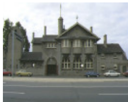
1 missions to seamen flinders street extension melbourne front elevation feb1986