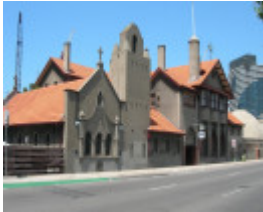
MISSIONS TO SEAMEN SOHE 2008