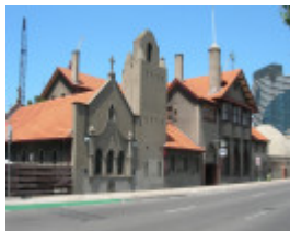
MISSIONS TO SEAMEN SOHE 2008