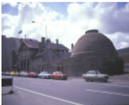
Missions to Seamen Flinders Street Extension Melbourne Dome January 1985