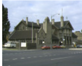
missions to seamen flinders street extension melb side elevation feb1986