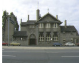
1 missions to seamen flinders street extension melbourne front elevation feb1986