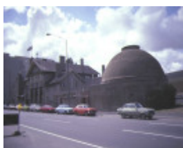
Missions to Seamen Flinders Street Extension Melbourne Dome January 1985