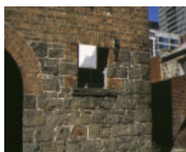
former phoenix clothing company king street melbourne detail of bluestone