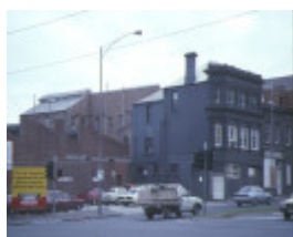
former phoenix clothing company king street melbourne site view