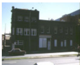
1 former phoenix clothing company king street melbourne front view