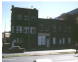
1 former phoenix clothing company king street melbourne front view