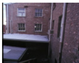
former phoenix clothing company king street melbourne side view rear windows