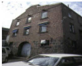
former phoenix clothing company king street melbourne rear view