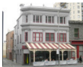
FORMER PHOENIX CLOTHING COMPANY SOHE 2008