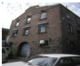
former phoenix clothing company king street melbourne rear view