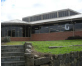
Building G, E J T Tippet Building.jpg