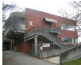
Building K, M B John Building.jpg