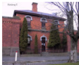
h01463 school of mines lydiard street south ballarat industry training bldg e