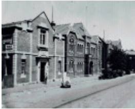
c1950s_School of Mines.jpg