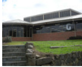
Building G, E J T Tippett Building.jpg