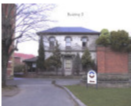
h01463 school of mines lydiard street south ballarat student services bldg d