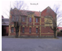
h01463 school of mines lydiard street south ballarat arts bldg b