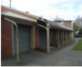
Building H and I, Corbould Building, Automotive Skills Centre.jpg