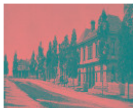
1882_Supreme Court Bldg.jpg