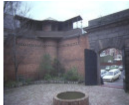
school of mines ballarat courthouse in gaol sep1984