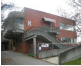
Building K, M B John Building.jpg