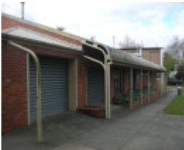
Building H and I, Corbould Building, Automotive Skills Centre.jpg