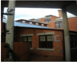
Building C, Old Chemistry Building.jpg