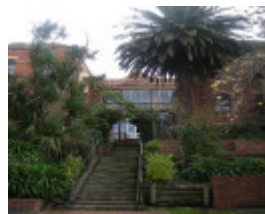
Landscape elements (2).jpg