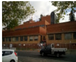
Building N and L, Flecknow Building, E J Barker Building.jpg