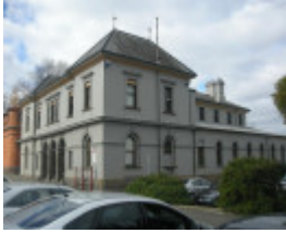
Building F, Former Supreme Court.jpg