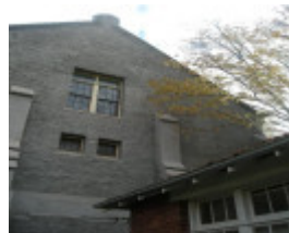
Building P, Former Wesleyan Chapel, later School of Mines Museum (rear).jpg