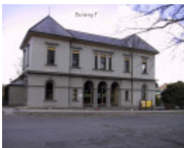
h01463 school of mines lydiard street south ballarat court house bldg f