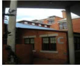
Building C, Old Chemistry Building.jpg