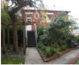
Building O, Old Plumbing Building.jpg