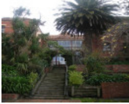
Landscape elements (2).jpg