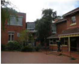
Building B, W J Gribble Building, former School of Technical Art.jpg