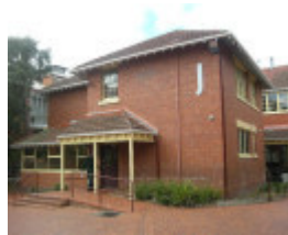
Building J, A W Steane Building (Former Junior Technical School).jpg