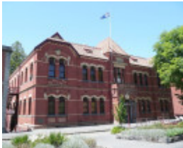
SCHOOL OF MINES SOHE 2008