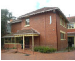
Building J, A W Steane Building (Former Junior Technical School).jpg