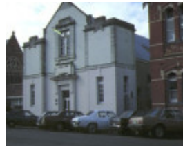
school of mines ballarat former church