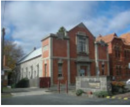
Building P, Former Wesleyan Chapel, later School of Mines Museum..jpg