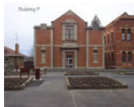
h01463 school of mines lydiard street south ballarat hairdressing bldg p