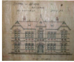
1899, Drawing (front elevation) for Administration Building, former new classrooms building (Building A).jpg