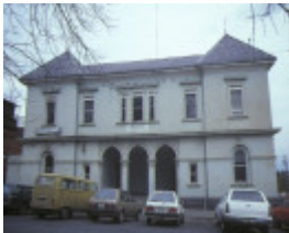
school of mines ballarat former courthouse