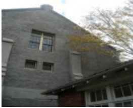
Building P, Former Wesleyan Chapel, later School of Mines Museum (rear).jpg