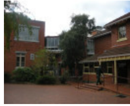
Building B, W J Gribble Building, former School of Technical Art.jpg