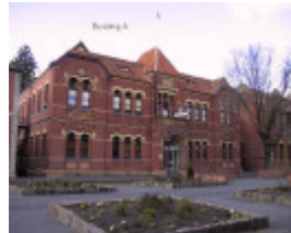
h01463 school of mines lydiard street south ballarat admin bldg a