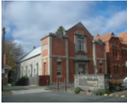
Building P, Former Wesleyan Chapel, later School of Mines Museum..jpg