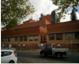
Building N and L, Flecknow Building, E J Barker Building.jpg