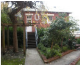
Building O, Old Plumbing Building.jpg