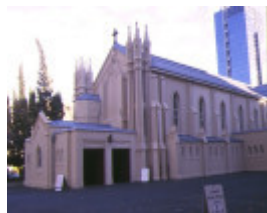
1 st francis catholic church melb east side view