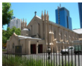
ST FRANCIS CATHOLIC CHURCH SOHE 2008