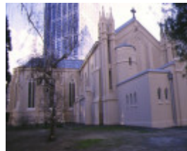
st francis catholic church melb west side view