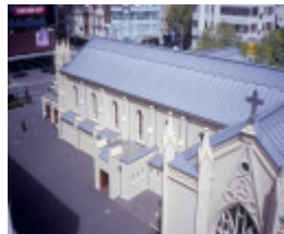
h00013 st francis catholic church lonsdale st melbourne roof she project 2003