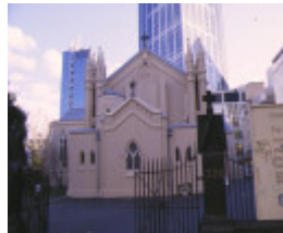
st francis catholic church melb front view