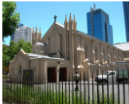
ST FRANCIS CATHOLIC CHURCH SOHE 2008