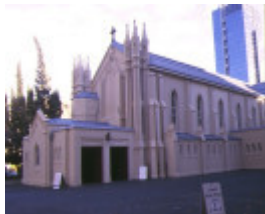
1 st francis catholic church melb east side view