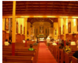
ST FRANCIS CATHOLIC CHURCH SOHE 2008