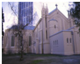
st francis catholic church melb west side view