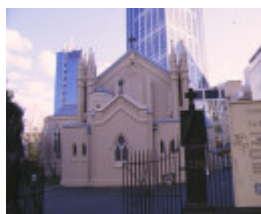
st francis catholic church melb front view