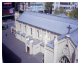
h00013 st francis catholic church lonsdale st melbourne roof she project 2003