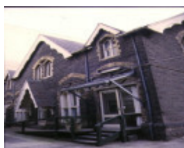
wesley church precinct lonsdale street melb former school