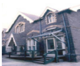
Wesley Church Lonsdale Street Melbourne School July 2003