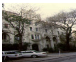
wesley church precinct lonsdale street melb princess mary club 1998