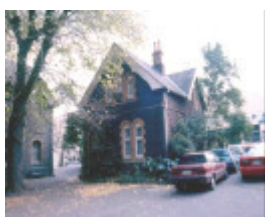
Wesley Church Lonsdale Street Melbourne Cottage July 2003