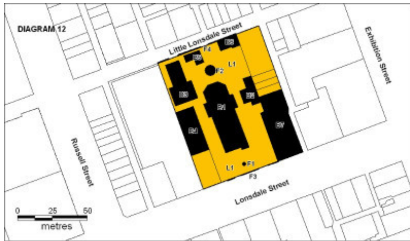
h00012 wesley church complex plan jan2004