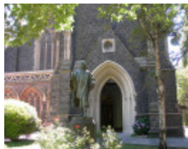
WESLEY CHURCH COMPLEX SOHE 2008