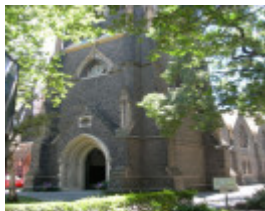
WESLEY CHURCH COMPLEX SOHE 2008