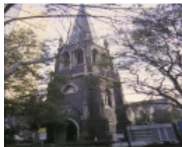
1 wesley church lonsdale street melb spire external view