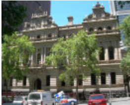
SUPREME COURT ANNEXE SOHE 2008