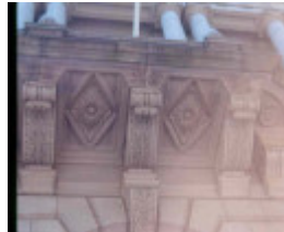
h01478 supreme court annexe detail