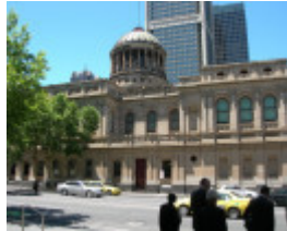
SUPREME COURT ANNEXE SOHE 2008