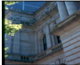
h01478 supreme court annexe detail