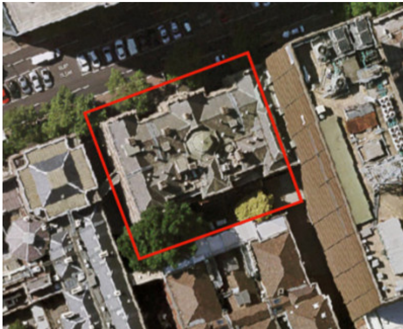
Aerial photo showing extent of registration