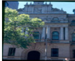
h01478 supreme court annexe