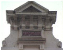
num pon soon little bourke street melbourne detail parapet