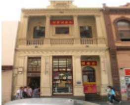
NUM PON SOON SOCIETY BUILDING SOHE 2008