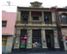
NUM PON SOON SOCIETY BUILDING July 2016