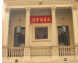
NUM PON SOON SOCIETY BUILDING SOHE 2008