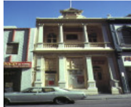
1 num pon soon little bourke street melbourne front view