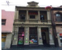
NUM PON SOON SOCIETY BUILDING July 2016