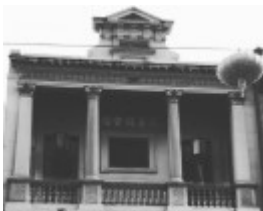
NUM PON SOON SOCIETY BUILDING July 2016