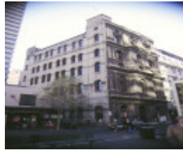
1 money order post office & savings bank little bourke street melb side view 1997