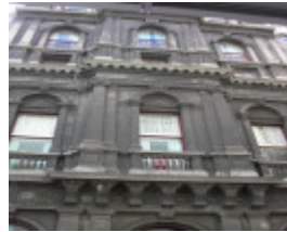
FORMER MONEY ORDER POST OFFICE AND SAVINGS BANK SOHE 2008