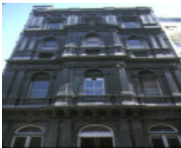
money order post office & savings bank little bourke street melb front view feb1983