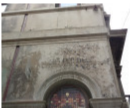
Money Order Office and Letter Delivery Branch - wording on sign