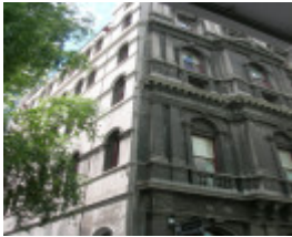
FORMER MONEY ORDER POST OFFICE AND SAVINGS BANK SOHE 2008