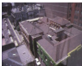
1 former high court building little bourke street melbourne aerial view feb1985