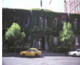
former high court building little bourke street melbourne front elevation jan1985