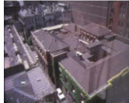
1 former high court building little bourke street melbourne aerial view feb1985