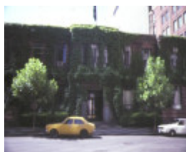
former high court building little bourke street melbourne front elevation jan1985