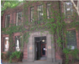
FEDERAL COURT OF AUSTRALIA SOHE 2008