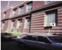
former high court building little bourke street melbourne side elevation jan1985