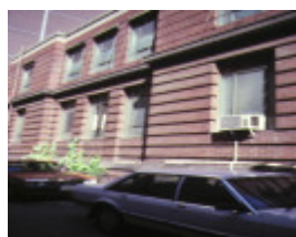
former high court building little bourke street melbourne side elevation jan1985