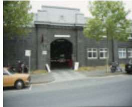
1 police garage russell street melbourne front view of entrance