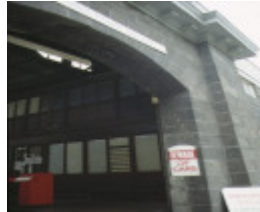
police garage russell street melbourne detail of entrance