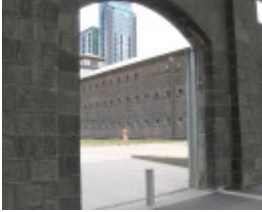
POLICE GARAGE SOHE 2008