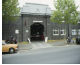
1 police garage russell street melbourne front view of entrance