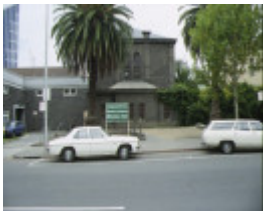
police garage russell street melbourne view of side of building