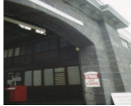
police garage russell street melbourne detail of entrance