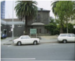
police garage russell street melbourne view of side of building