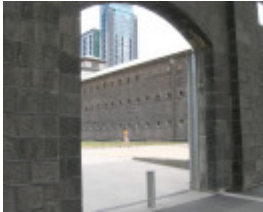
POLICE GARAGE SOHE 2008