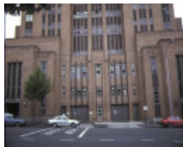
police headquarter's complex russell street melbourne entrance feb1985