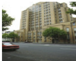
police headquarter's complex russell street melbourne front view