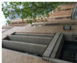
POLICE HEADQUARTERS COMPLEX Nov 2016