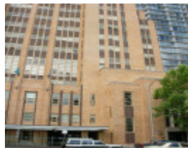
POLICE HEADQUARTERS COMPLEX SOHE 2008