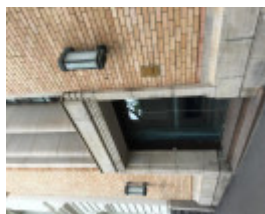
POLICE HEADQUARTERS COMPLEX Nov 2016