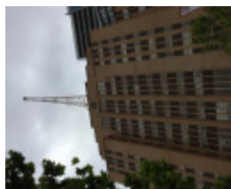
POLICE HEADQUARTERS COMPLEX Nov 2016