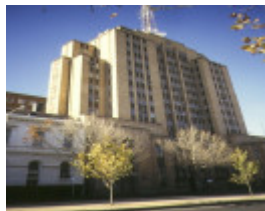
1 police headquarter's complex russell street melbourne front elevation jun1997