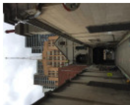
POLICE HEADQUARTERS COMPLEX Nov 2016