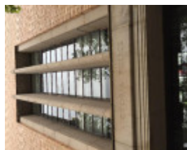
POLICE HEADQUARTERS COMPLEX Nov 2016