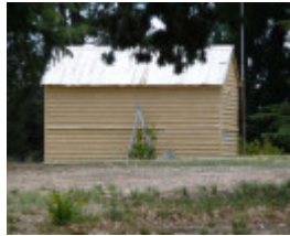
BALLARAT MUNICIPAL OBSERVATORY SOHE 2008