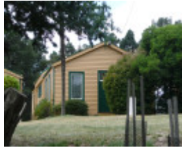
BALLARAT MUNICIPAL OBSERVATORY SOHE 2008