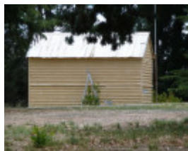
BALLARAT MUNICIPAL OBSERVATORY SOHE 2008