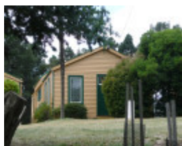
BALLARAT MUNICIPAL OBSERVATORY SOHE 2008