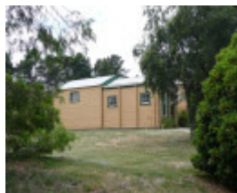
BALLARAT MUNICIPAL OBSERVATORY SOHE 2008