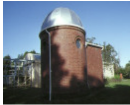
ballarat municipal observatory front view