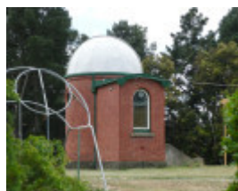
BALLARAT MUNICIPAL OBSERVATORY SOHE 2008