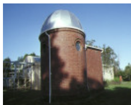
ballarat municipal observatory front view