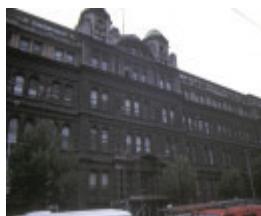
1 former victorian railway headquarters spencer street melbourne vline head office