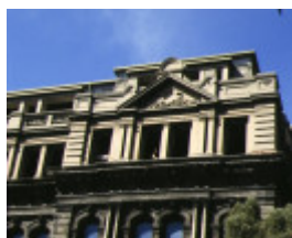
former victorian railway headquarters spencer street melbourne detail of top windows of railway headquarters