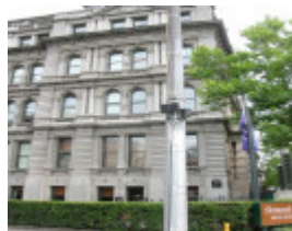
FORMER VICTORIAN RAILWAY HEADQUARTERS SOHE 2008