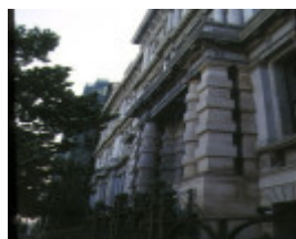
former victorian railway headquarters detail of front pillars