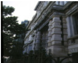
former victorian railway headquarters detail of front pillars