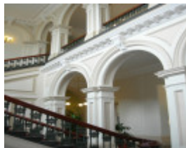
FORMER VICTORIAN RAILWAY HEADQUARTERS SOHE 2008