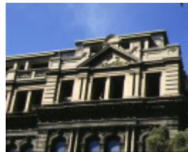
former victorian railway headquarters spencer street melbourne detail of top windows of railway headquarters