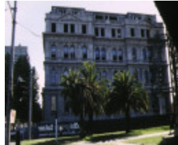
former victorian railway headquarters spencer street melbourne front view railway headquarters