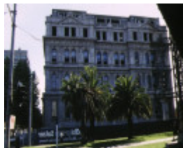
former victorian railway headquarters spencer street melbourne front view railway headquarters