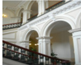
FORMER VICTORIAN RAILWAY HEADQUARTERS SOHE 2008