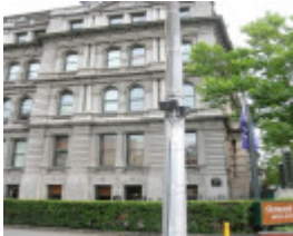
FORMER VICTORIAN RAILWAY HEADQUARTERS SOHE 2008